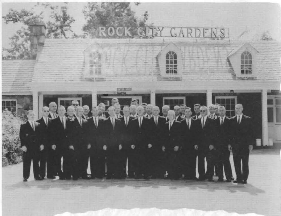
The Rock City Chorus