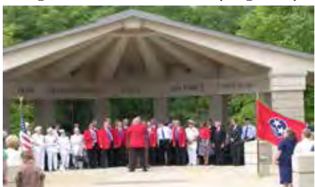
Memorial and Veterans Day