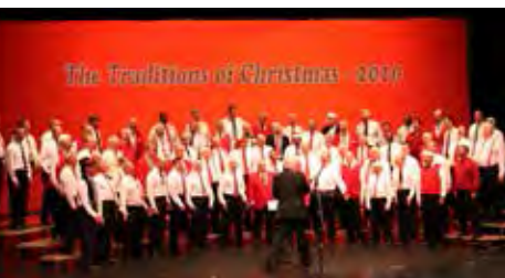
Community Christmas Chorus