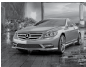
New 2013 Mercedes-Benz CL300