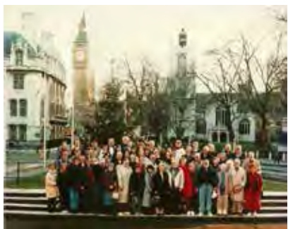
The London Trip