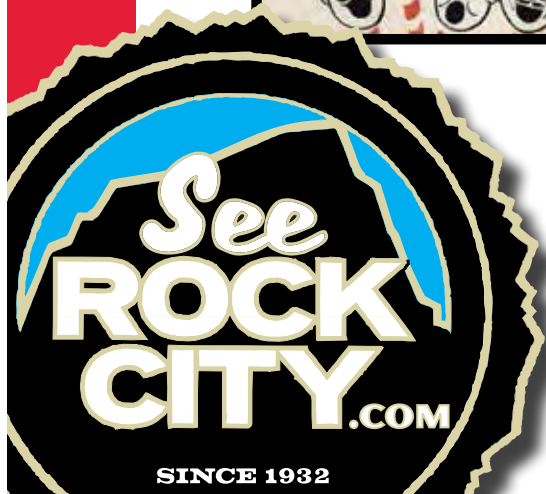
atop Lookout Mountain near Chattanooga.