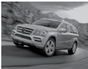
New 2013 Mercedes-Benz GL450