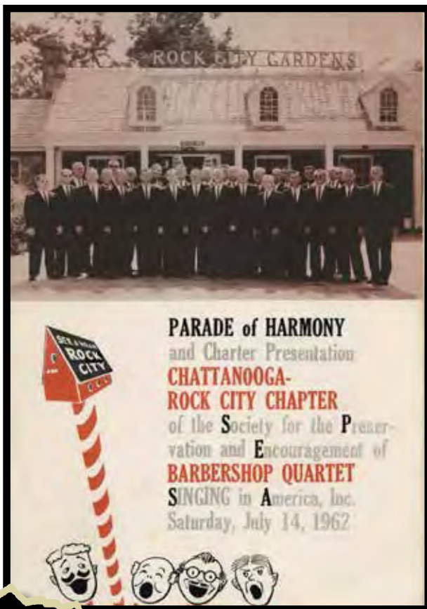
Cover art from the 1962 chorus program

Supporting the Choo Choo Chorus, Then & Now.