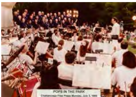
Pops in the Park with Symphony