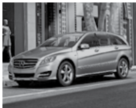
New 2013 Mercedes-Benz R350