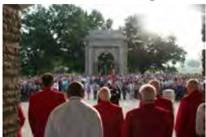
Scout Flag Day