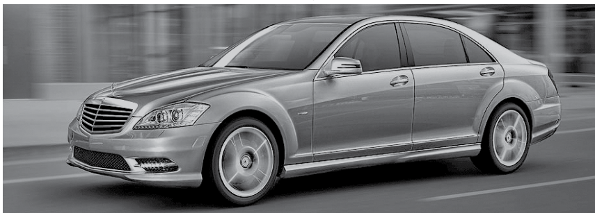
The New 2013 Mercedes-Benz S550

Proof That Form, Function And Beauty Can All Exist In The Same Place.