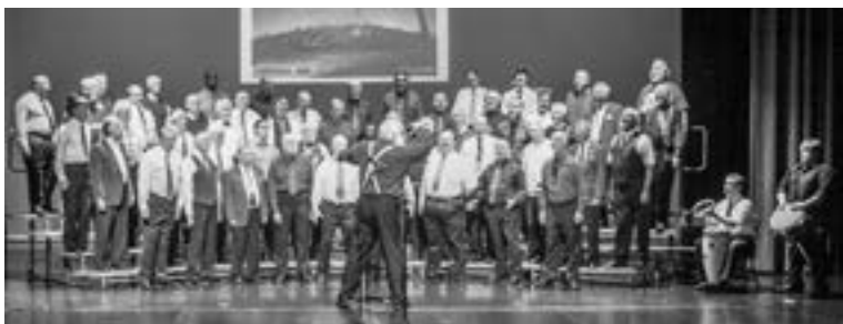
The 2014 Chattanooga Community Christmas Chorus